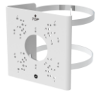
SN-CBK627D Pole Mount