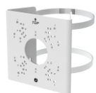
SN-CBK627D Pole Mount